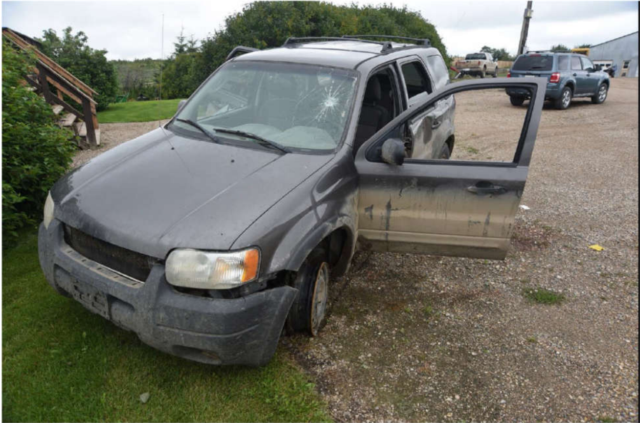
Picture 2: The Ford Escape where it came to rest on the Stanley property