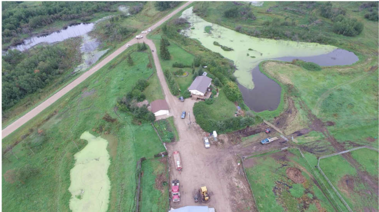
Picture 1: Aerial view of the Stanley property showing the Ford Escape (nearest to the house), and RCMP vehicles on the roadway at the entrance to the property

[16] The Ford Escape stopped in the Stanleys' yard. E. M. and C. C. got out of the vehicle and appeared to interact with a truck parked on the property. One of the pair then jumped onto an all-terrain vehicle that was also in the yard. After seeing this happen, Mr. Stanley and S. S. ran into the yard and yelled for the strangers to stop what they were doing, as they believed that the group was attempting to steal their property.